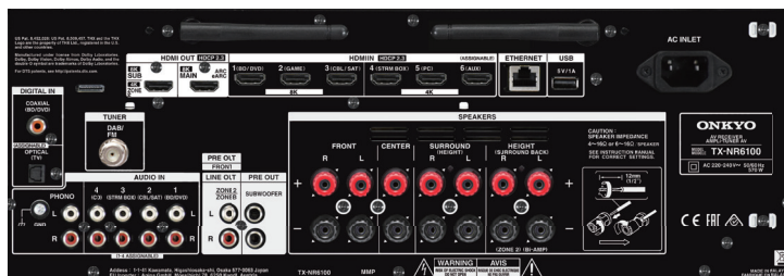
Text on receiver may vary with region.